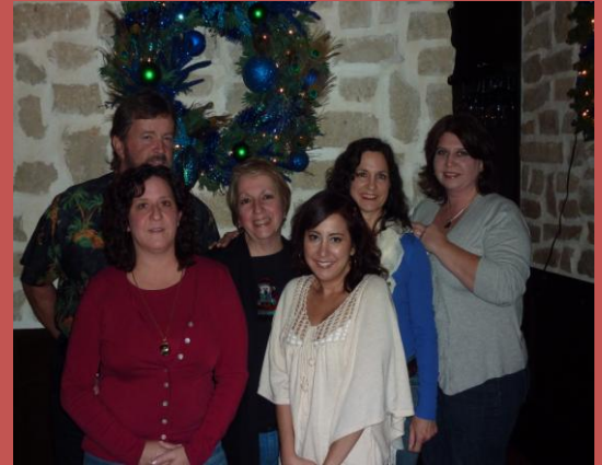
SW Tampa Christmas Party