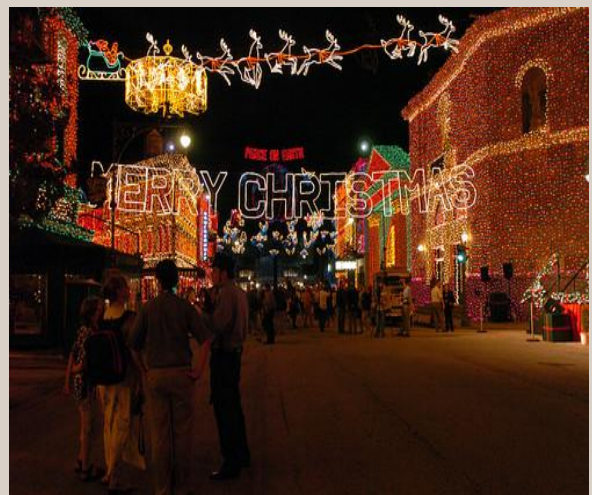
Disney's Hollywood Studios Theme Park